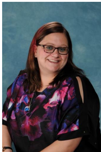
Deputy DSL & Mental Health First Aider