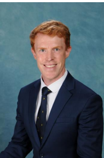
Designated Safeguarding Lead